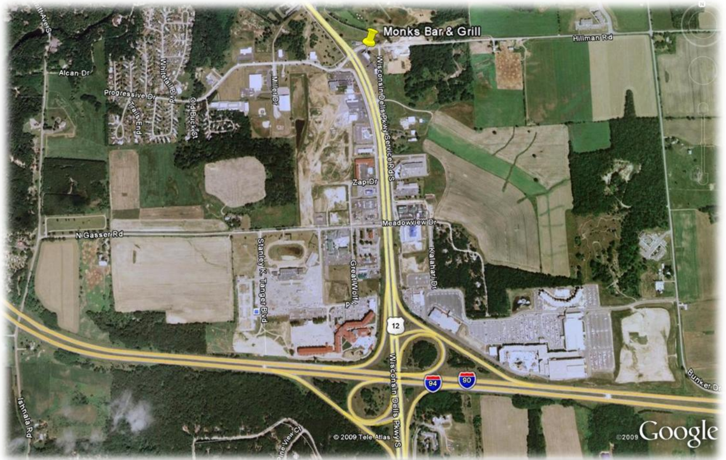
Google Earth Map